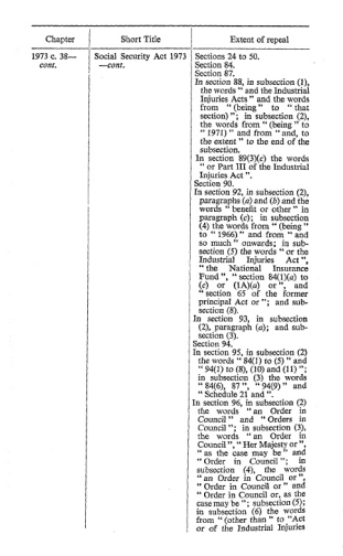
Schedule 1 Schedule 1