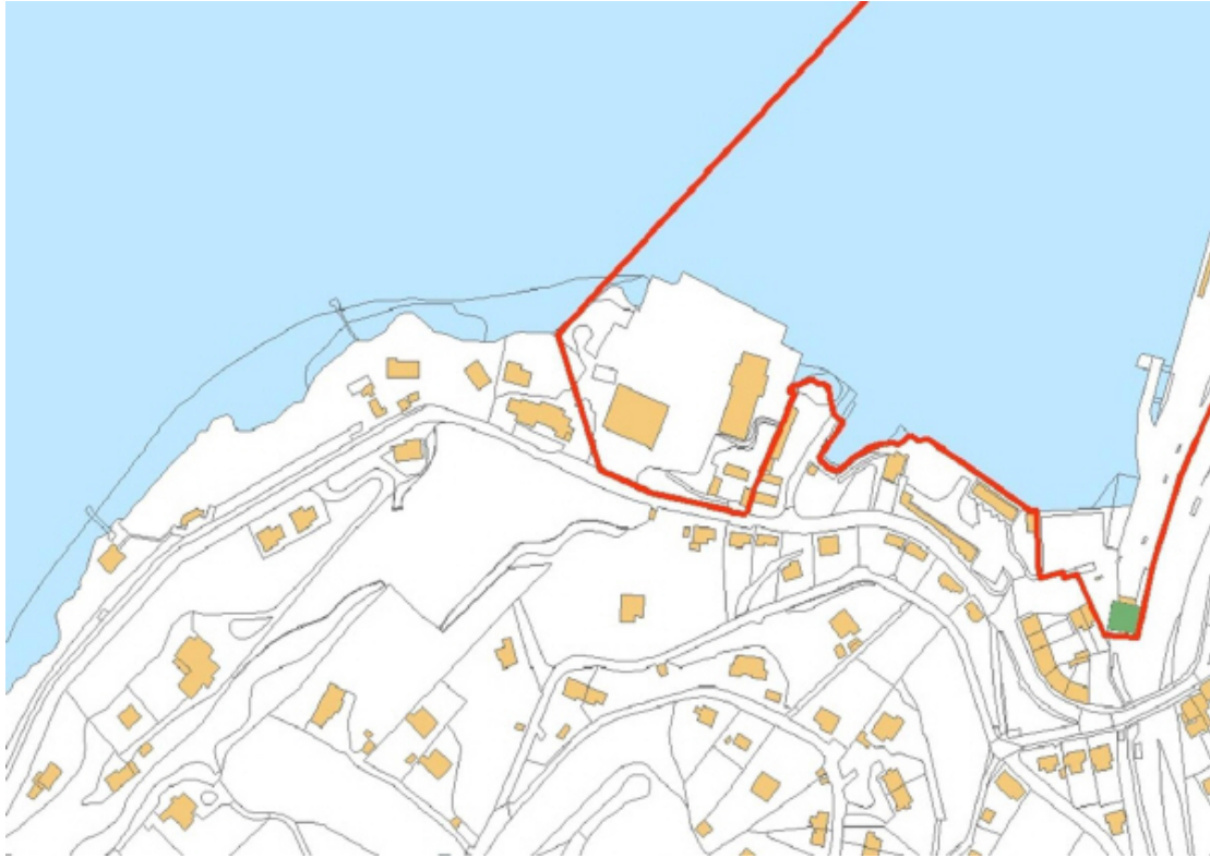
Inset Plan 1