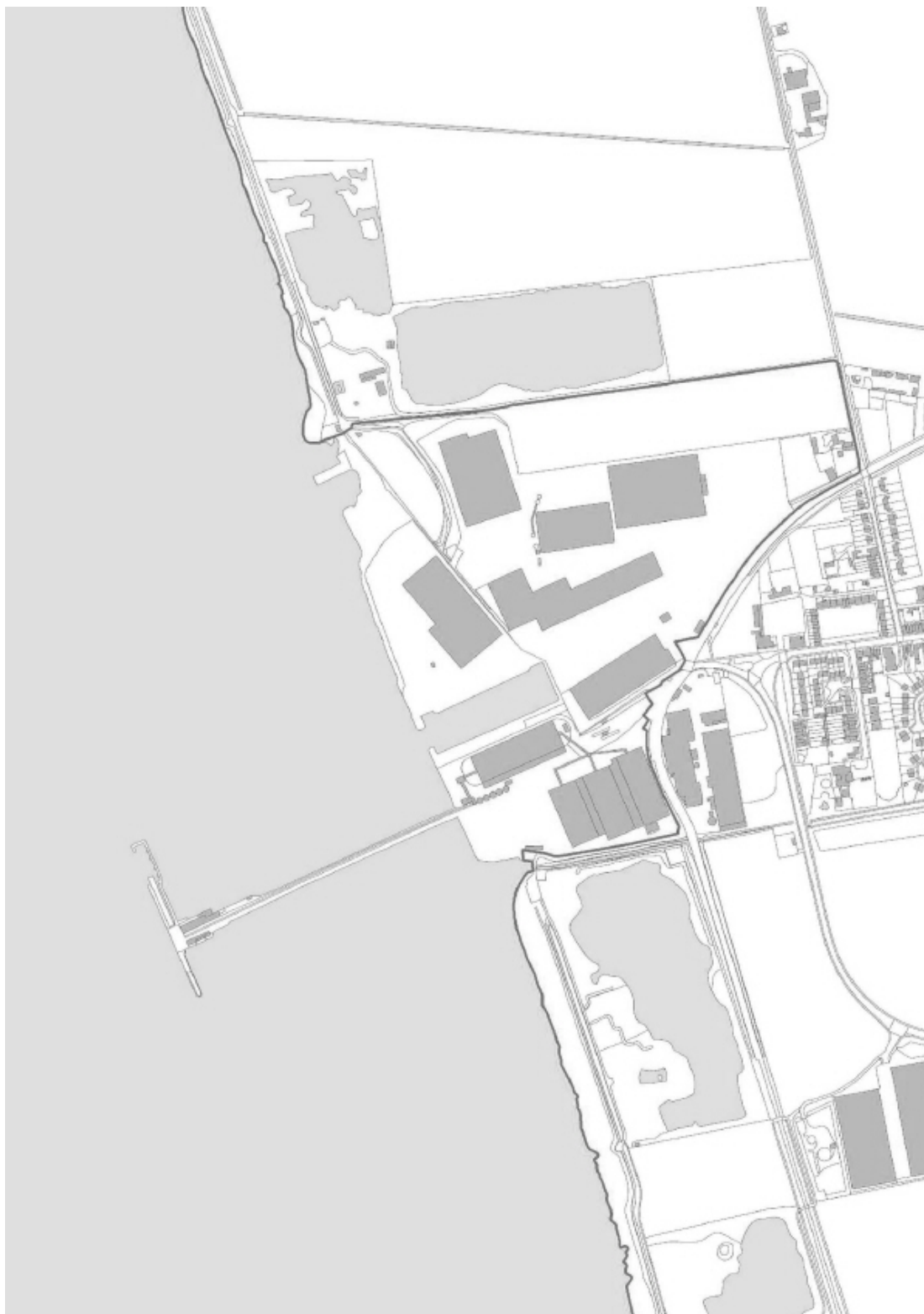
Inset Plan 2—New Holland

Changes to legislation: There are currently no known outstanding effects for the The Port Security (Port of Hull, New Holland, Immingham and Grimsby) Designation Order 2013. (See end of Document for details)