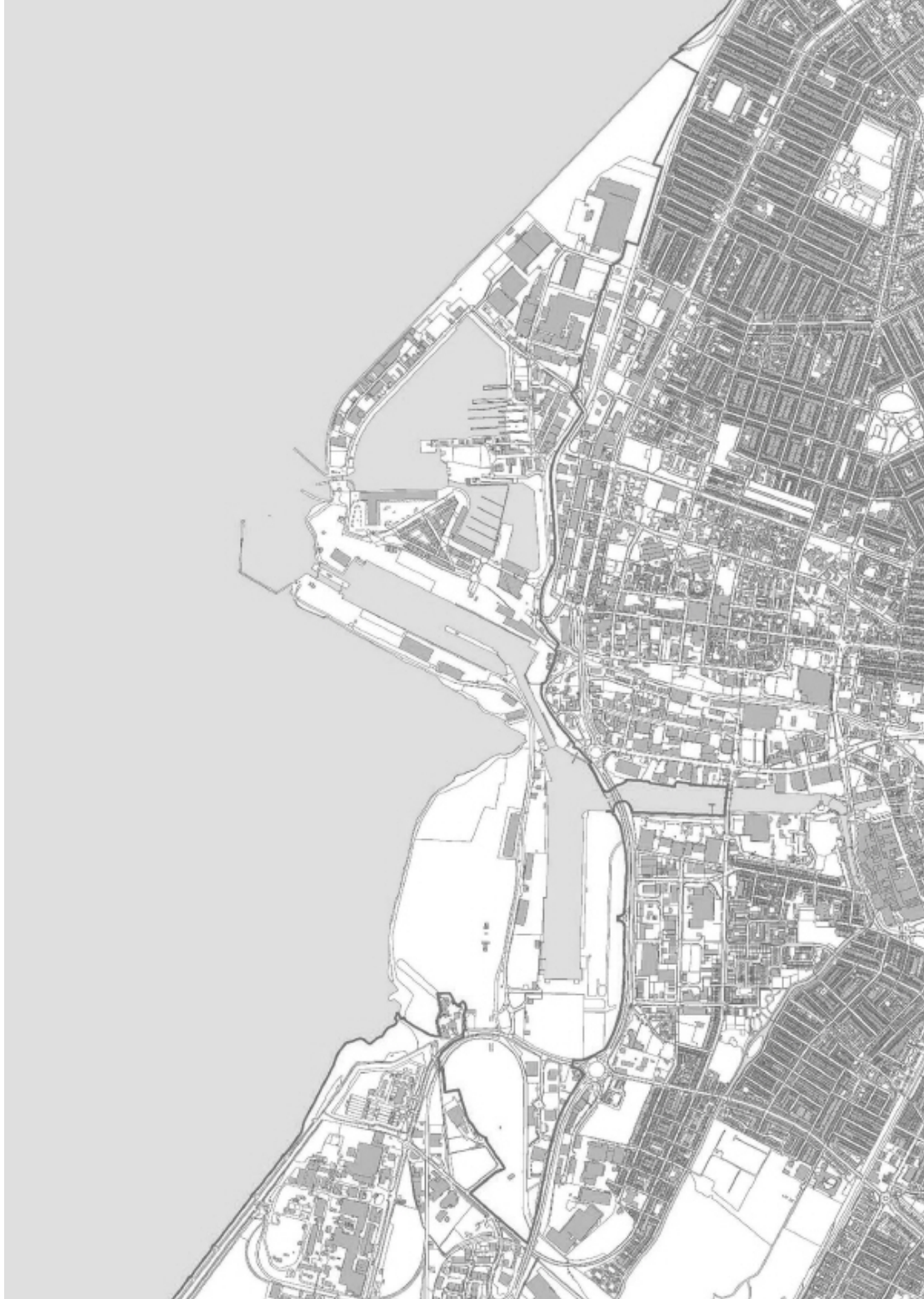
Inset Plan 8–Grimsby

Changes to legislation: There are currently no known outstanding effects for the The Port Security (Port of Hull, New Holland, Immingham and Grimsby) Designation Order 2013. (See end of Document for details)