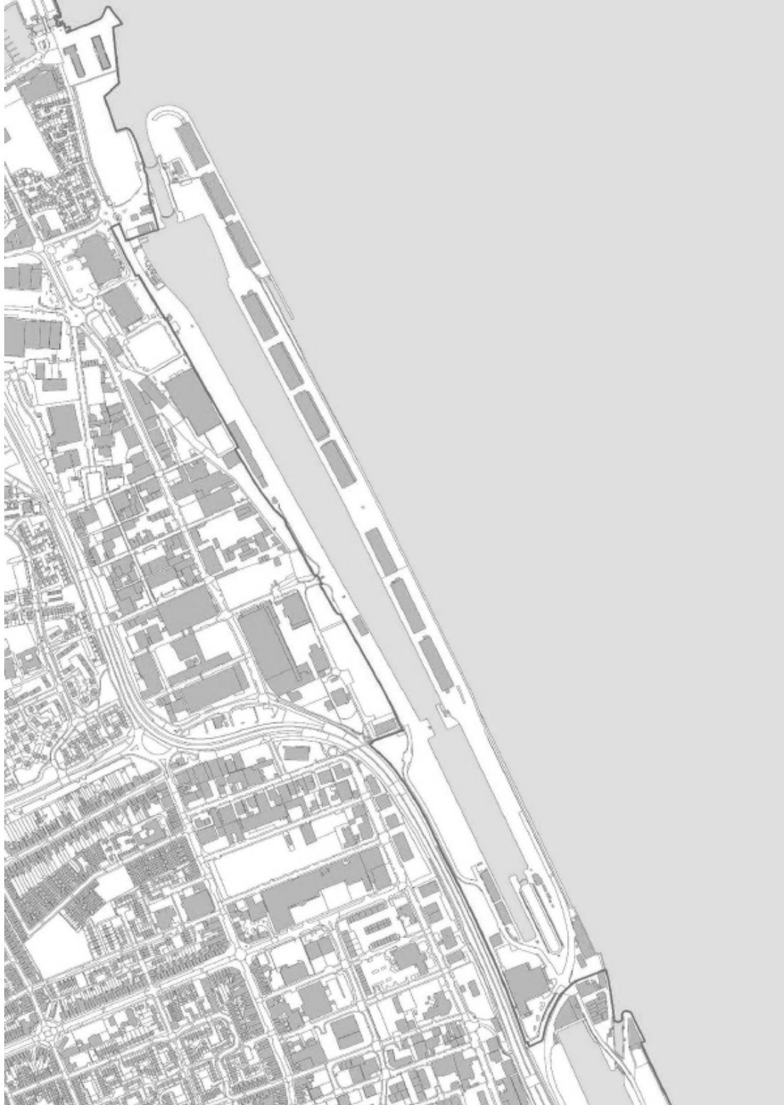
Inset Plan 3—Albert & William

Changes to legislation: There are currently no known outstanding effects for the The Port Security (Port of Hull, New Holland, Immingham and Grimsby) Designation Order 2013. (See end of Document for details)