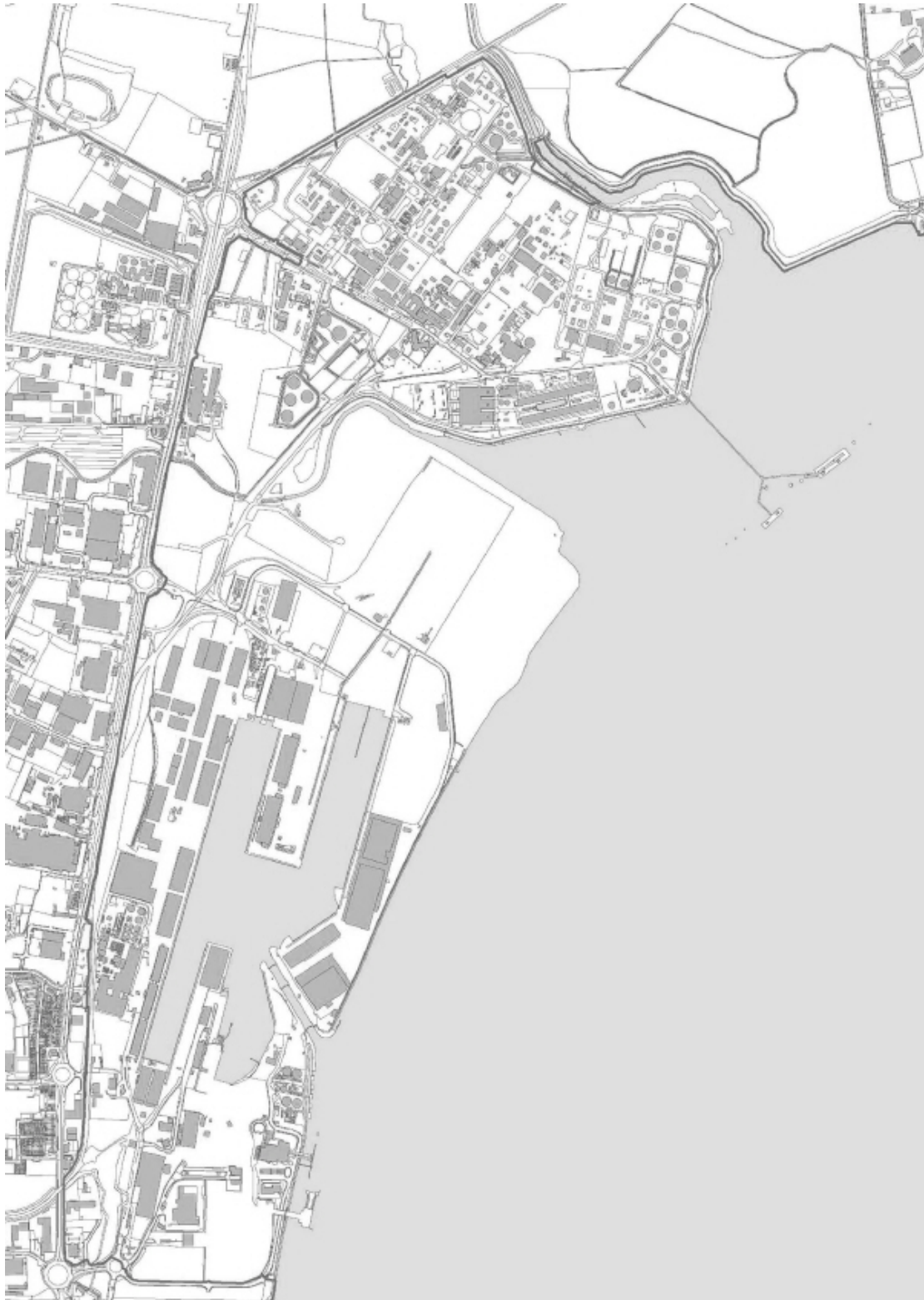
Inset Plan 5—King George & Salt End

Changes to legislation: There are currently no known outstanding effects for the The Port Security (Port of Hull, New Holland, Immingham and Grimsby) Designation Order 2013. (See end of Document for details)