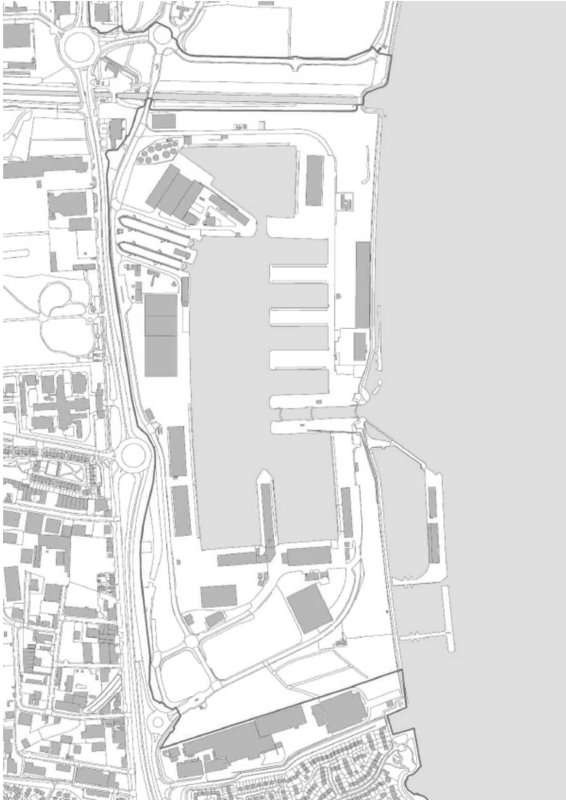
Inset Plan 4—Alexandra

Changes to legislation: There are currently no known outstanding effects for the The Port Security (Port of Hull, New Holland, Immingham and Grimsby) Designation Order 2013. (See end of Document for details)