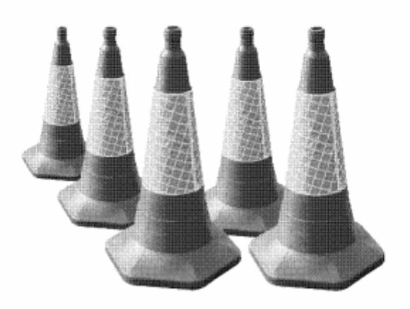
Traffic Management Act 2004 Approved Version