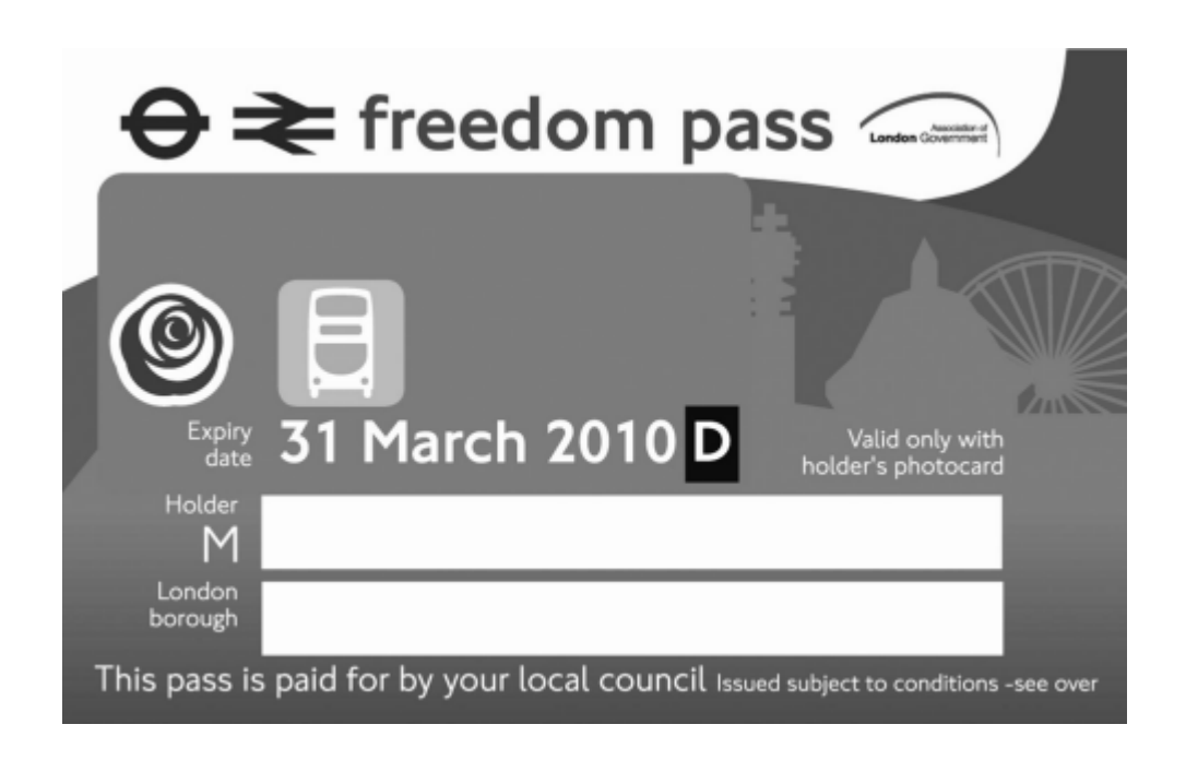
SCHEDULE 5 Regulation 4