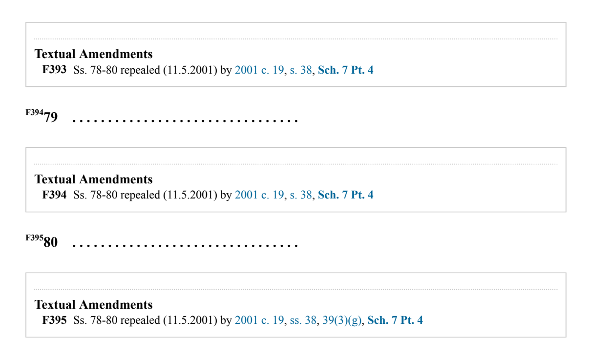
Service of sentence of imprisonment or detention

Changes to legislation: Naval Discipline Act 1957 (repealed) is up to date with all changes known to be in force on or before 13 May 2024. There are changes that may be brought into force at a future date. Changes that have been made appear in the content and are referenced with annotations. (See end of Document for details)