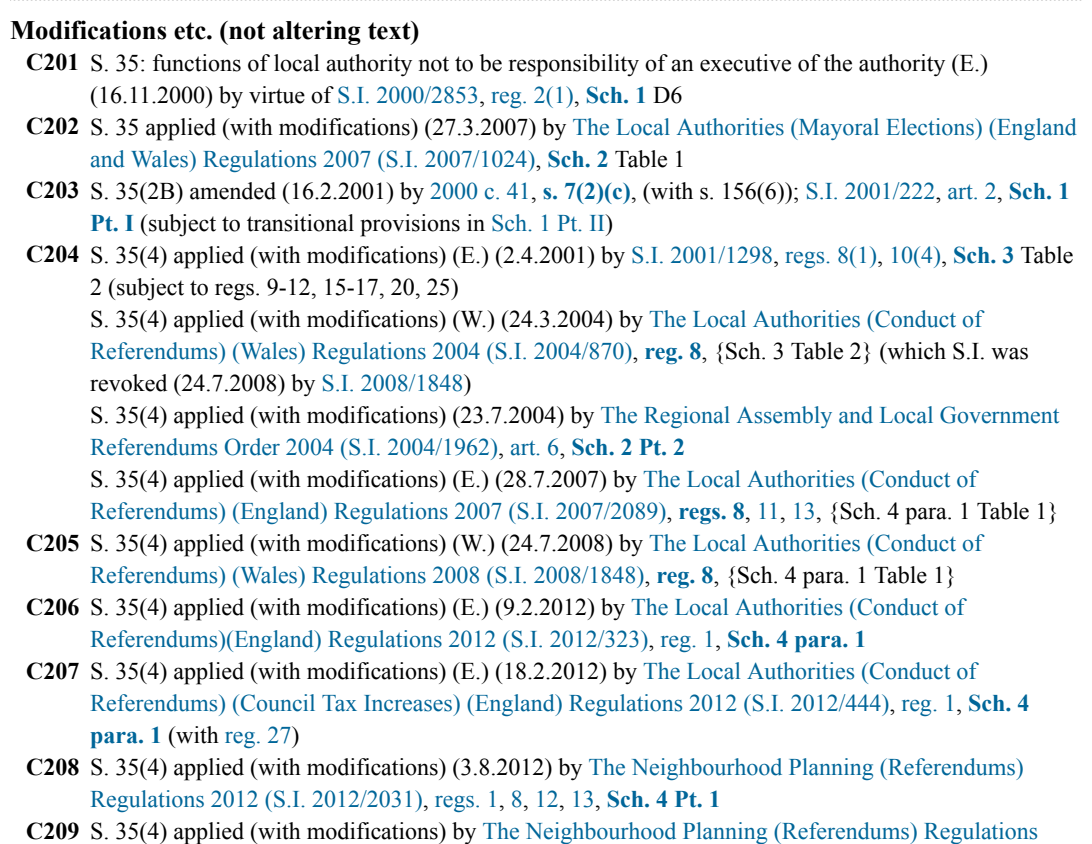
(C209 S. 35(4) applied (with modifications) by The Neighbourhood Planning (Referendums) Regulations 2012 (S.I. 2012/2031), reg. 17, Sch. 8 Table 1 (as inserted (E.W.) (6.4.2013) by S.I. 2013/798, regs. 1, 7, Sch. 3)