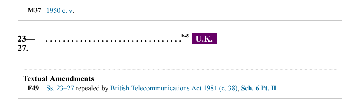
Charges and other Terms and Conditions applicable to Services

Changes to legislation: Post Office Act 1969 is up to date with all changes known to be in force on or before 18 September 2023. There are changes that may be brought into force at a future date. Changes that have been made appear in the content and are referenced with annotations. (See end of Document for details)