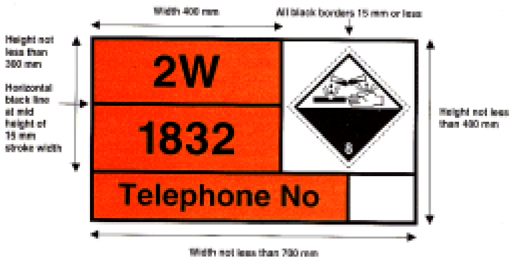
Hazard warning panel

The emergency action code shall be inscribed in the upper half and the UN number in the lower half of the orange-coloured panel and the telephone number beneath the UN number.