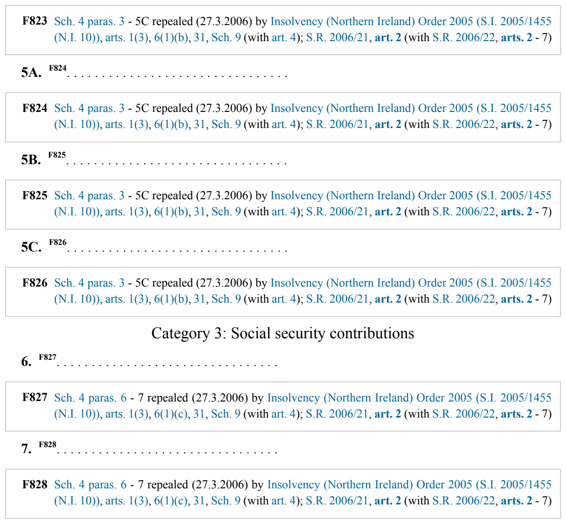
Category 4: Contributions to occupational pension schemes, etc.

Status: Point in time view as at 26/06/2020. This version of this Order contains provisions that are prospective. Changes to legislation: The Insolvency (Northern Ireland) Order 1989 is up to date with all changes known to be in force on or before 11 April 2024. There are changes that may be brought into force at a future date. Changes that have been made appear in the content and are referenced with annotations. (See end of Document for details)