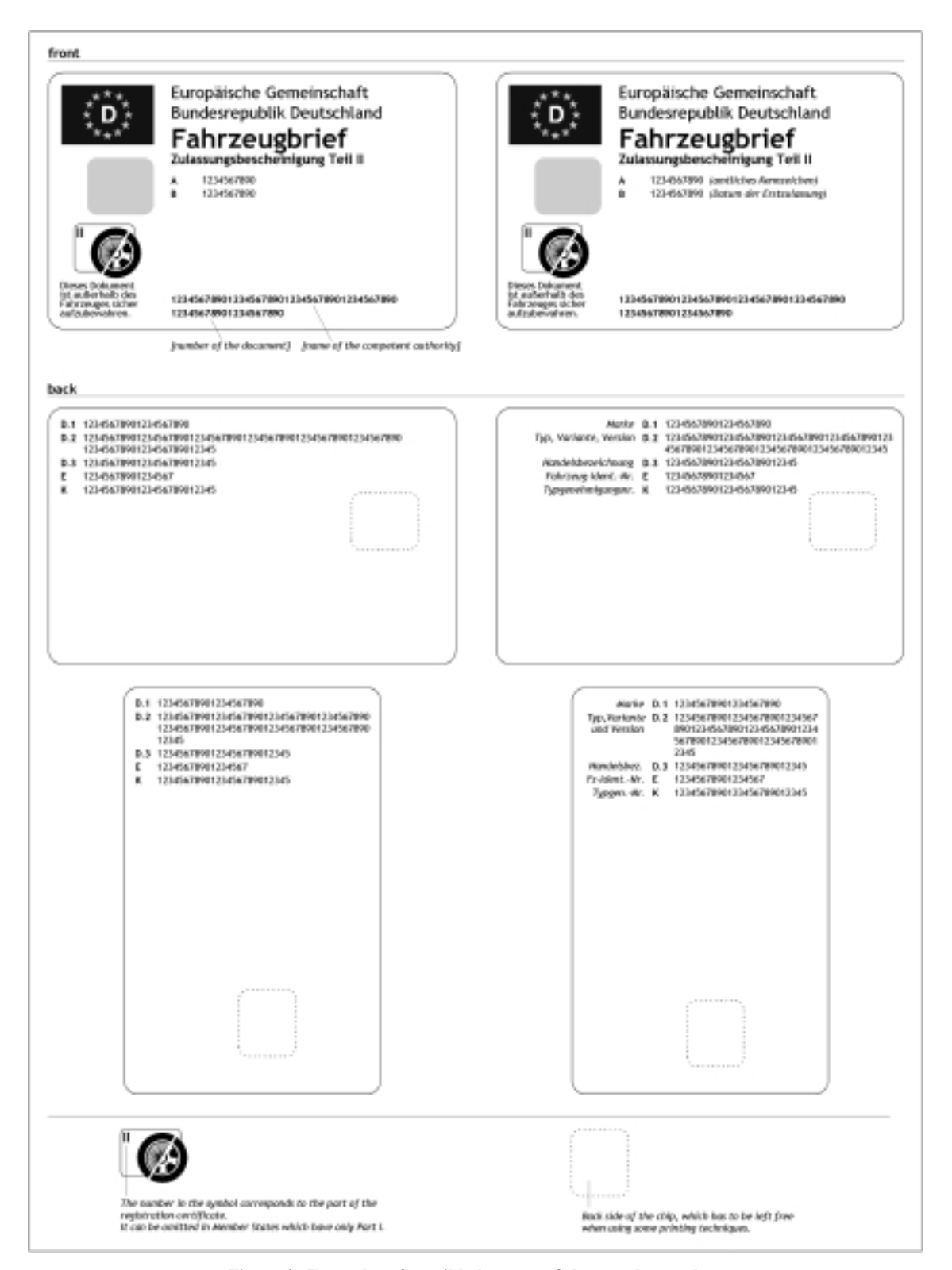
Figure 2: Examples of possible lay-outs of the mandatory data

(more optional and additional data may be added to the back side of the card)