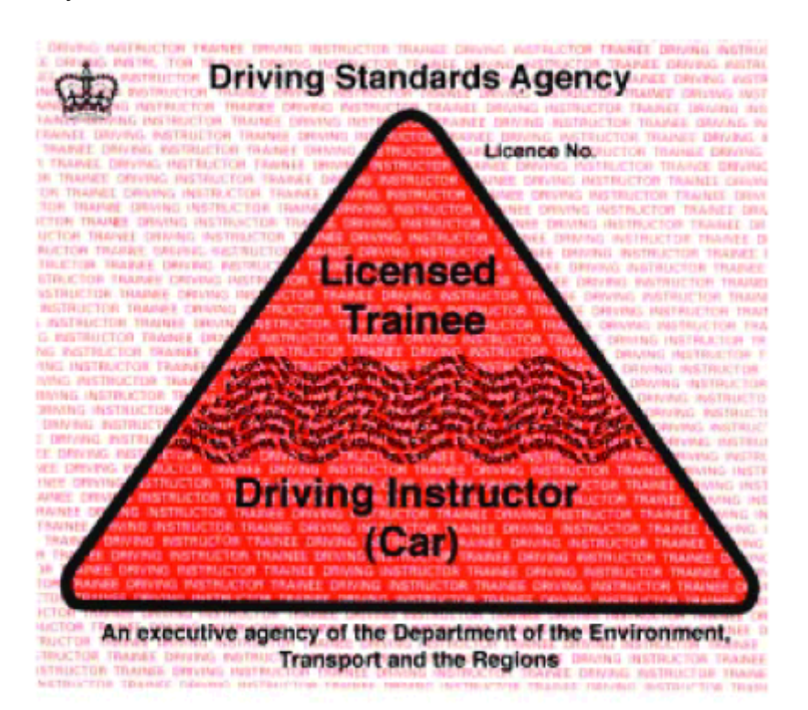
Back of licence