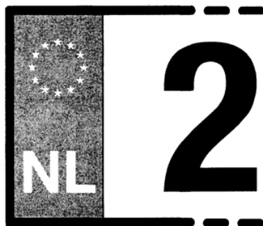
MODEL 1 (example)