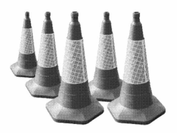
Traffic Management Act 2004 Approved Version