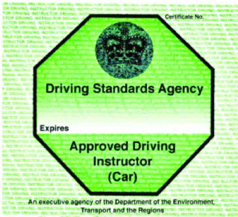
Back of licence

Status: This is the original version (as it was originally made). This item of legislation is currently only available in its original format.