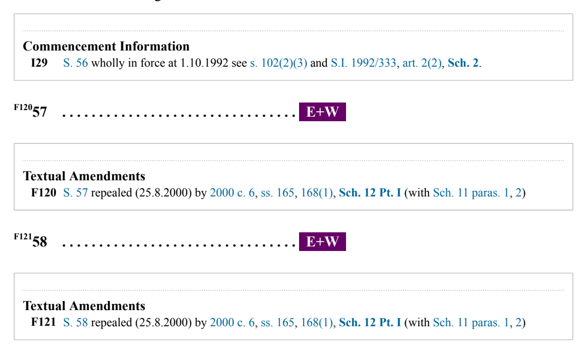
Detention etc. pending trial

In this subsection "local authority" and "parental responsibility" have the same meanings as in the Children Act 1989."