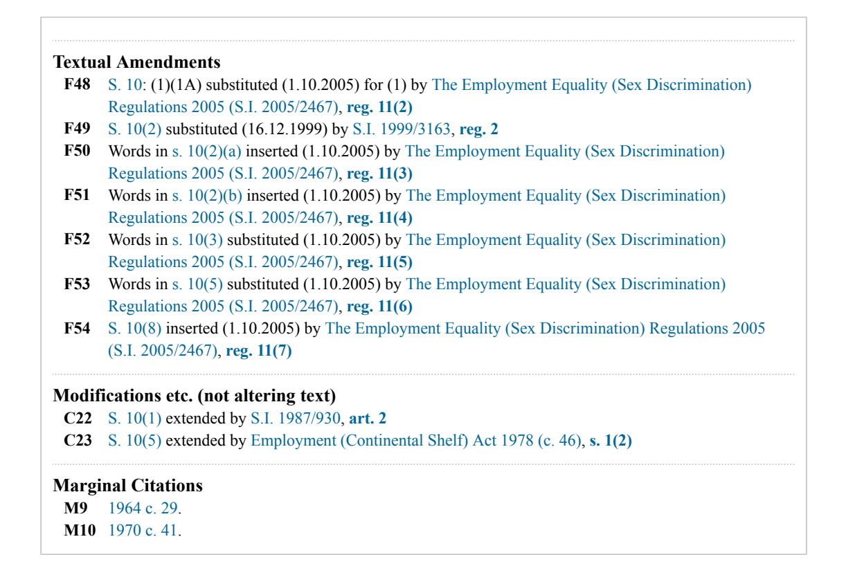
I<sup>F55</sup>Discrimination against office-holders etc.

Changes to legislation: Sex Discrimination Act 1975 (repealed) is up to date with all changes known to be in force on or before 21 May 2023. There are changes that may be brought into force at a future date. Changes that have been made appear in the content and are referenced with annotations. (See end of Document for details)