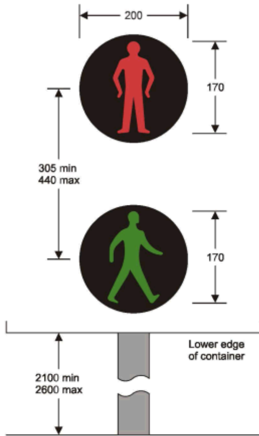
4002.1 Light signals for pedestrians