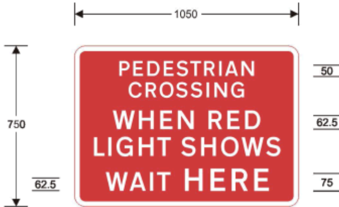
7011.2 Same as diagram 7011 where there is a portable signal-controlled pedestrian facility