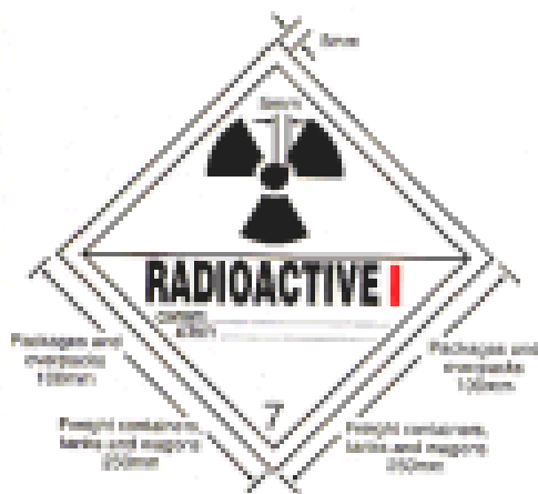
The background colour of the label shall be white, the colour of the trefoil and the printing shall be in black, and the colour of the category bar shall be red.