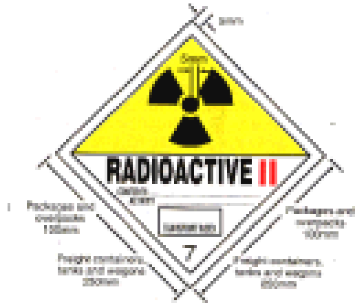
Fig. 3. Category II-YELLOW Label

The background colour of the upper half of the label shall be yellow and the lower half white, the colour of the trefoil and the printing shall be in black, and the colour of the category bars shall be red.