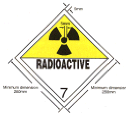
Fig. 5. Placard

Minimum dimensions are given: when larger dimensions are used the relative proportions must be maintained. The figure “7” shall not be less than 25mm high. The background colour of the upper half of the placard shall be yellow and the lower half white, the colour of the trefoil and the printing shall be black. The use of the word “RADIOACTIVE” in the bottom half is optional to allow the alternative use of this placard to display the appropriate United Nations number for the consignments.