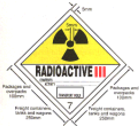
Fig. 4. Category III-YELLOW Label

The background colour of the upper half of the label shall be yellow and the lower half white, the colour of the trefoil and the printing shall be in black, and the colour of the category bars shall be red.