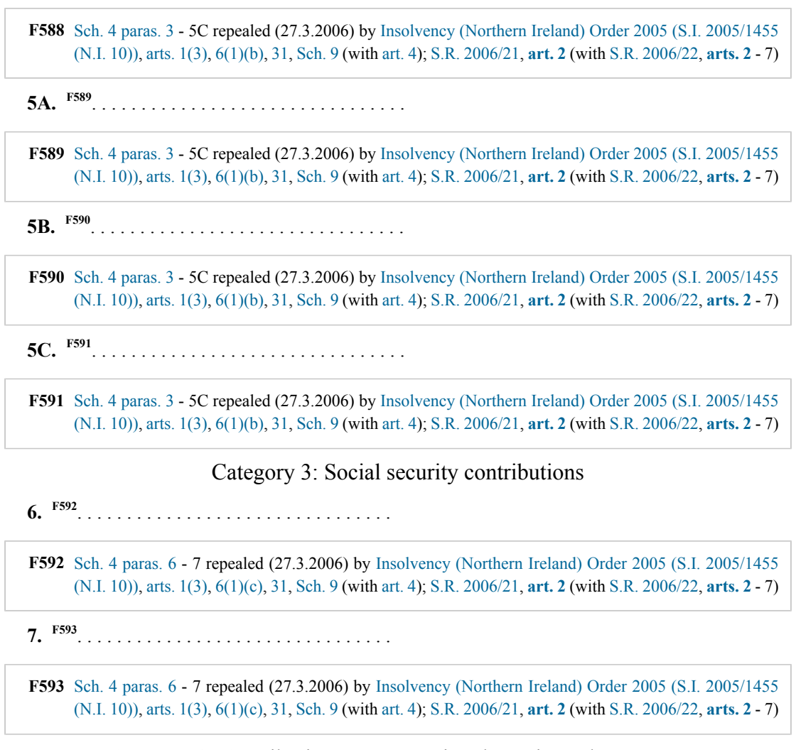
Category 4: Contributions to occupational pension schemes, etc.

Changes to legislation: The Insolvency (Northern Ireland) Order 1989 is up to date with all changes known to be in force on or before 15 April 2024. There are changes that may be brought into force at a future date. Changes that have been made appear in the content and are referenced with annotations. (See end of Document for details)