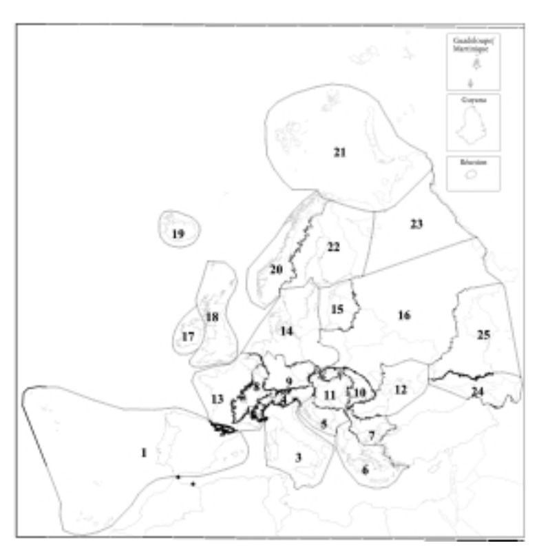
MAP A System A: Ecoregions for rivers and lakes