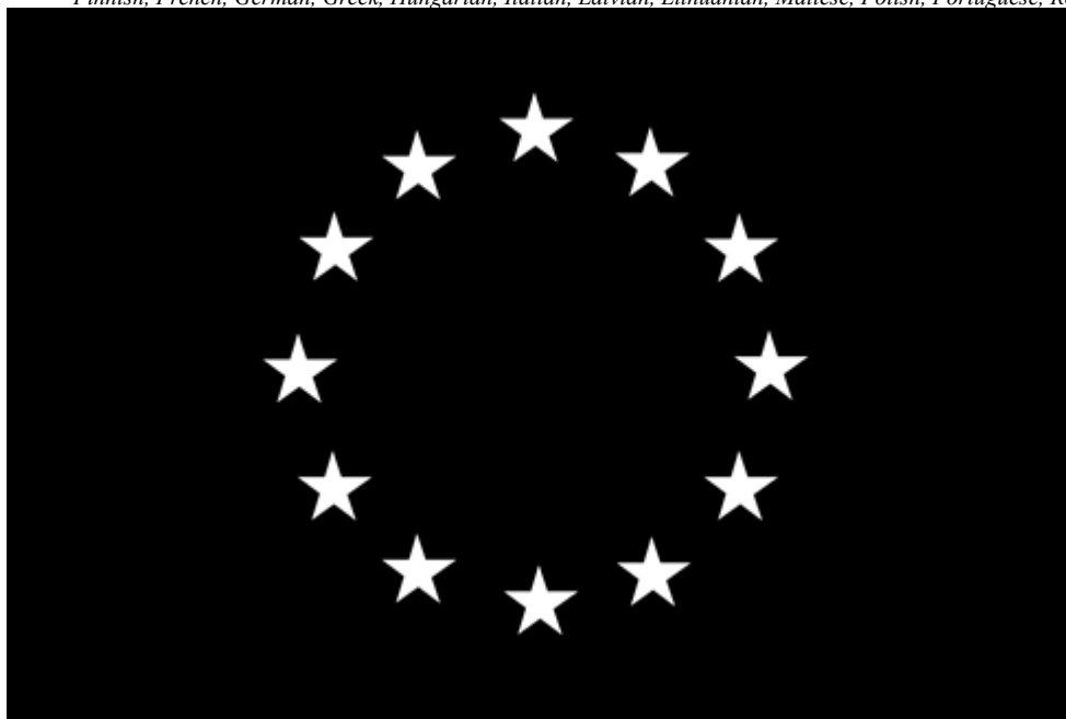
Reproduction on a coloured background

Changes to legislation: There are currently no known outstanding effects for the Commission Decision of 5 March 2008 laying down rules for the implementation of Council Decision 2007/435/EC establishing the European Fund for the Integration of third-country nationals for the period 2007 to 2013 as part of the General programme 'Solidarity and Management of Migration Flows' as regards Member States' management and control systems, the rules for administrative and financial management and the eligibility of expenditure on projects co-financed by the Fund (notified under document number C(2008) 795) (Only the Bulgarian, Czech, Dutch, English, Estonian, Finnish, French, German, Greek, Hungarian, Italian, Latvian, Lithuanian, Maltese, Polish, Portuguese, Romanian, ... (tails))