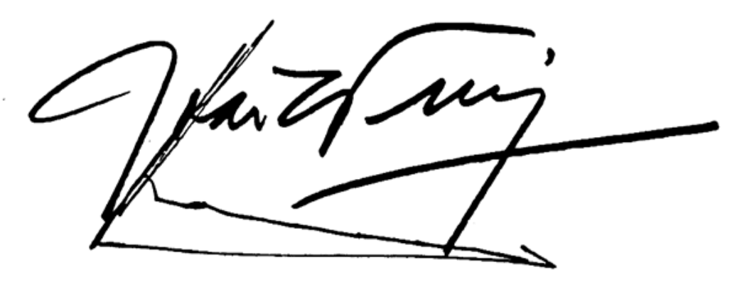
Pour le royaume de Belgique Voor het Koninkrijk België

Por el Consejo y la Comisión de las Comunidades Europeas For Rådet og Kommissionen for De Europæiske Fællesskaber Für den Rat und die Kommission der Europäischen Gemeinschaften Για το Συμβούλιο και την Επιτροπή των Ευρωπαϊκών Κοινοτήτων For the Council and the Commission of the European Communities Pour le Conseil et la Commission des Communautés européennes Per il Consiglio e la Commissione delle Comunità europee Voor de Raad en de Commissie van de Europese Gemeenschappen Pelo Conselho e pela Comissão das Comunidades Europeias